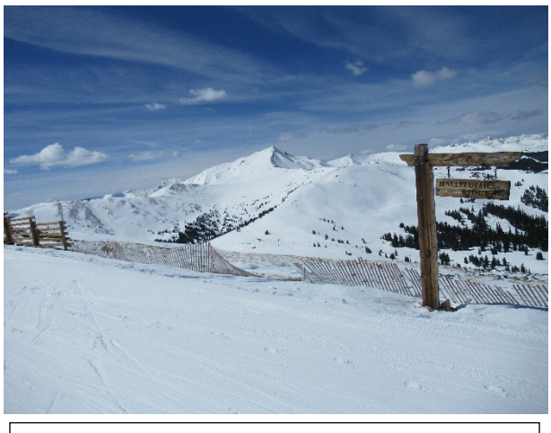
Jacques Peak from Hallelujah Ridge