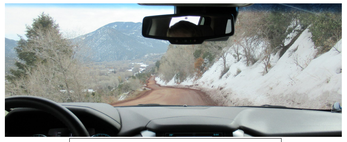
The narrow road on the "short-cut" to Taos Resort.