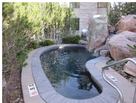
Two secluded hot tubs at the Tamarack Condos