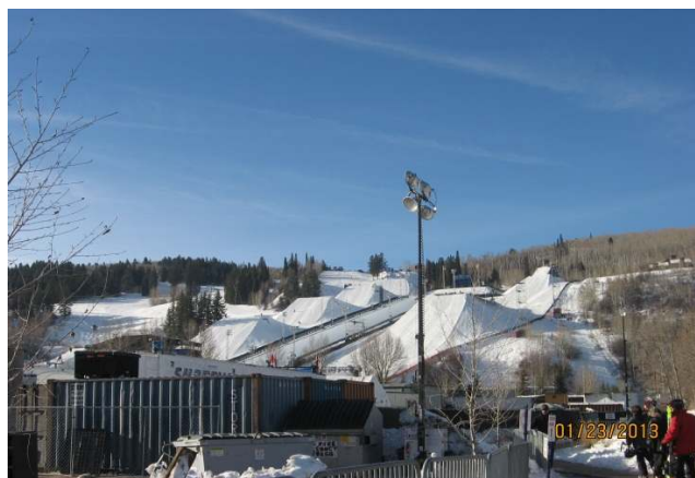
X Games jumps and half pipe at Buttermilk. Those jump ramps are massive.