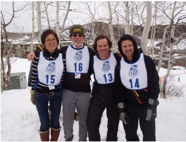
The team getting ready to tear up the course