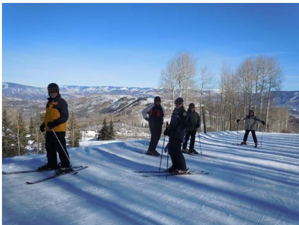
We own the mountain

Tuesday was another bluebird day of skiing at Snowmass. With the official start of the FSA trip still a day away there was plenty of wide open terrain to ski upon and enjoy.