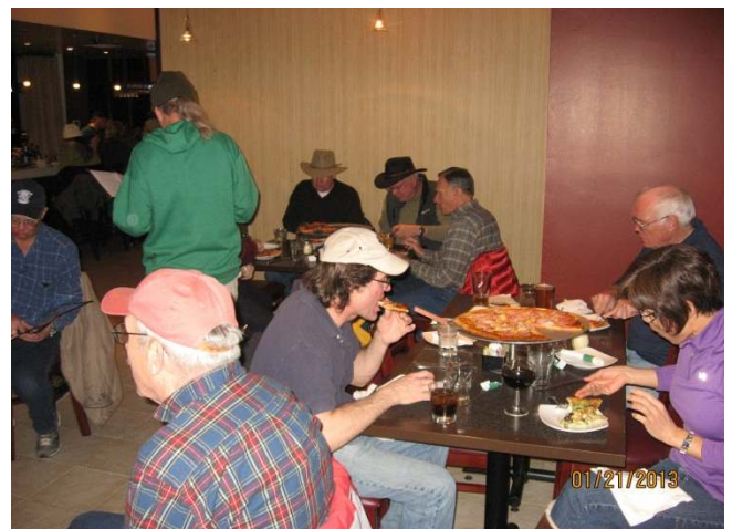
Followed by welcome pizza party