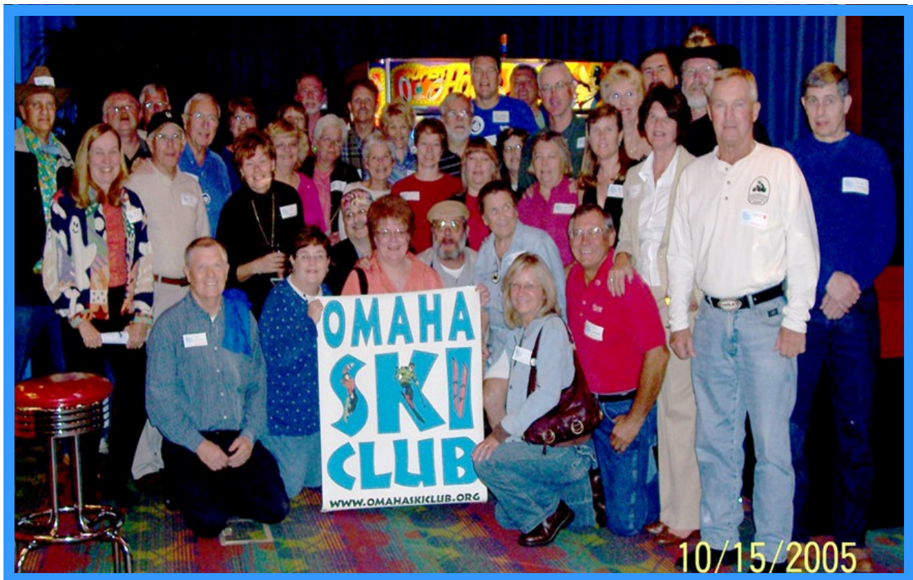
Alumni Reunion and Season Kickoff Party October 15, 2005