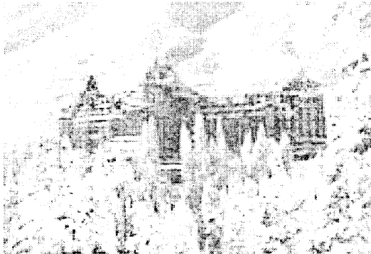
The Castle in the Forest