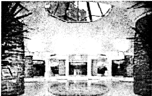
World Class European Spa