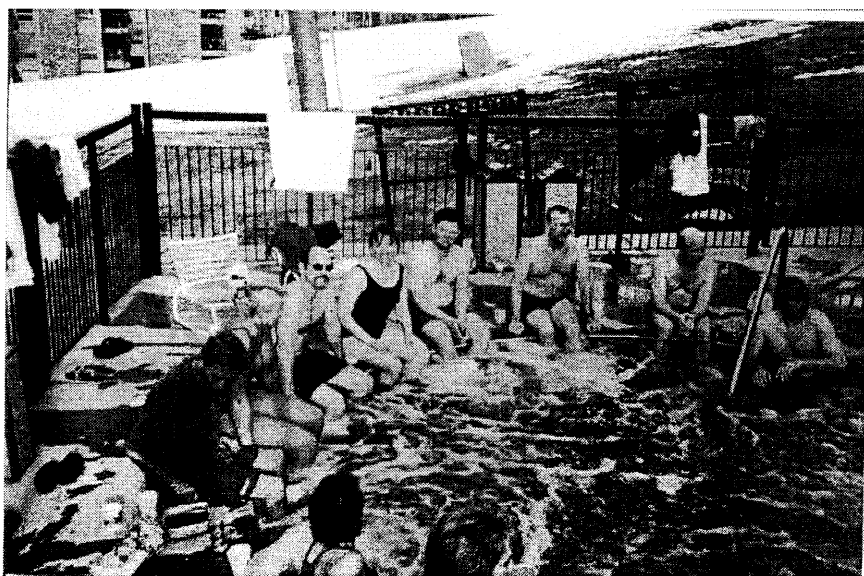
Hot tub at the Crestwood. Snowmass, CO, April 2002